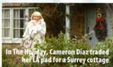
In The Holiday , Cameron Diaz traded her LA pad for a Surrey cottage

This beach home is in the area where William Shatner and Bruce Willis own homes. Other celeb residents include Mel Gibson, Richard Gere, Robert Redford, Sting (in a residence once owned by Dallas star Larry Hagman) and Bill Murray. Courteney Cox Arquette and husband David have bought a second house in the Paradise Cove area. Accommodation The ultra-modern house has three bedrooms and five bathrooms plus a swimming pool, Jacuzzi, sauna, gym and surf boards. There are three maids, a handyman and several cars including a Mercedes S500, a Jeep and a Porsche 928S. No smokers or pets.