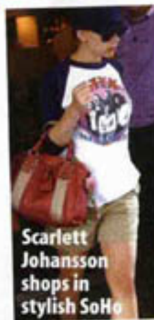
Scarlett Johansson shops in stylish SoHo

This spacious loft conversion is located in the trendy SoHo area of New York's Manhattan district. It's surrounded by fabulous shops and boutiques which attract stars such as Julia Roberts and Scarlett Johansson.