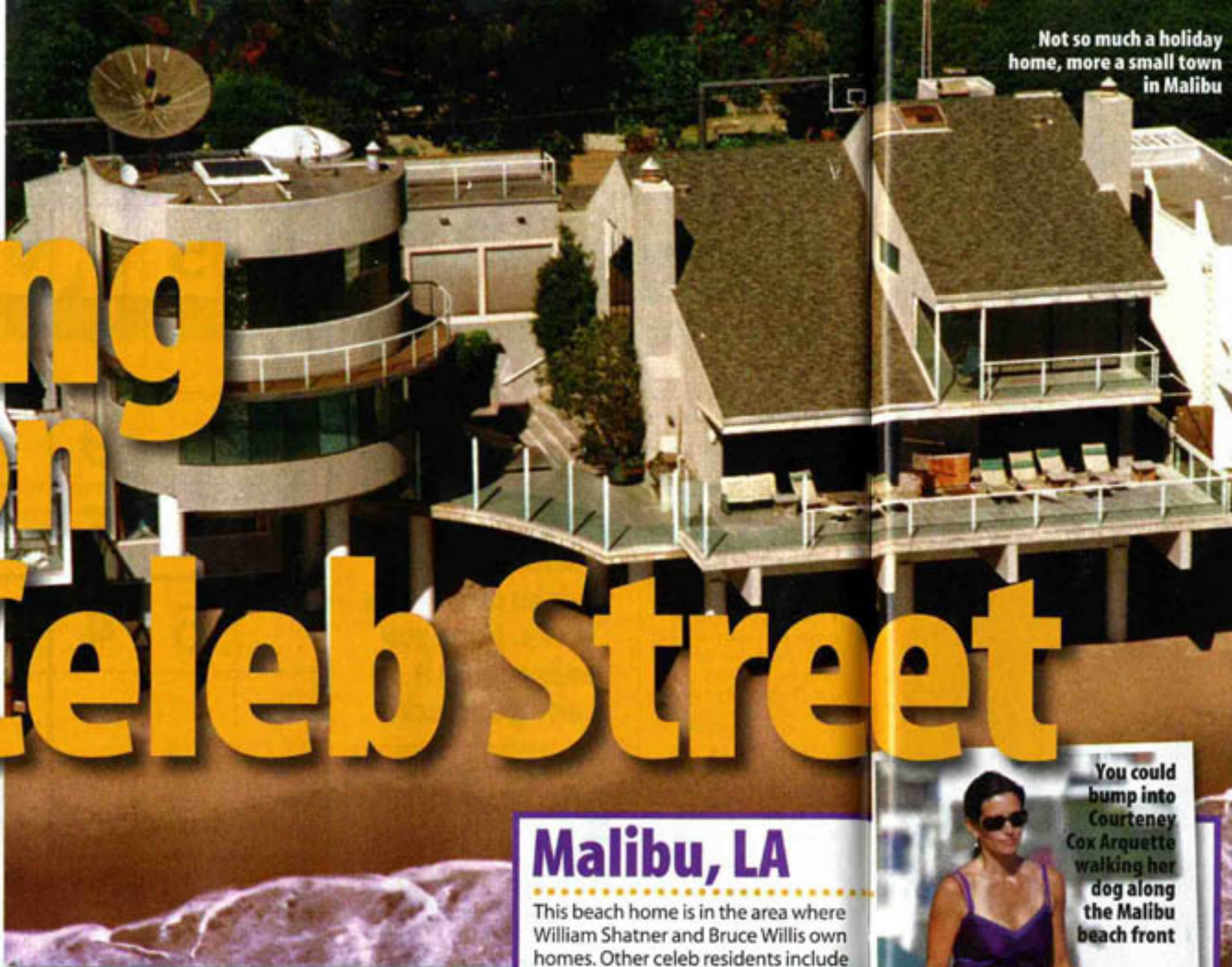
Not so much a holiday home, more a small town in Malibu