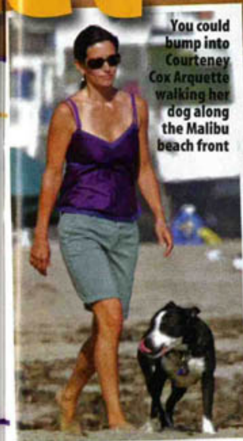
You could bump into Courteney Cox Arquette walking her dog along the Malibu beach front

Accommodation Split-level, open plan and über-stylish, the loft contains two bedrooms and two bathrooms.