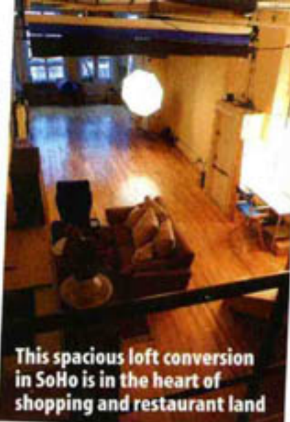
This spacious loft conversion in SoHo is in the heart of shopping and restaurant land