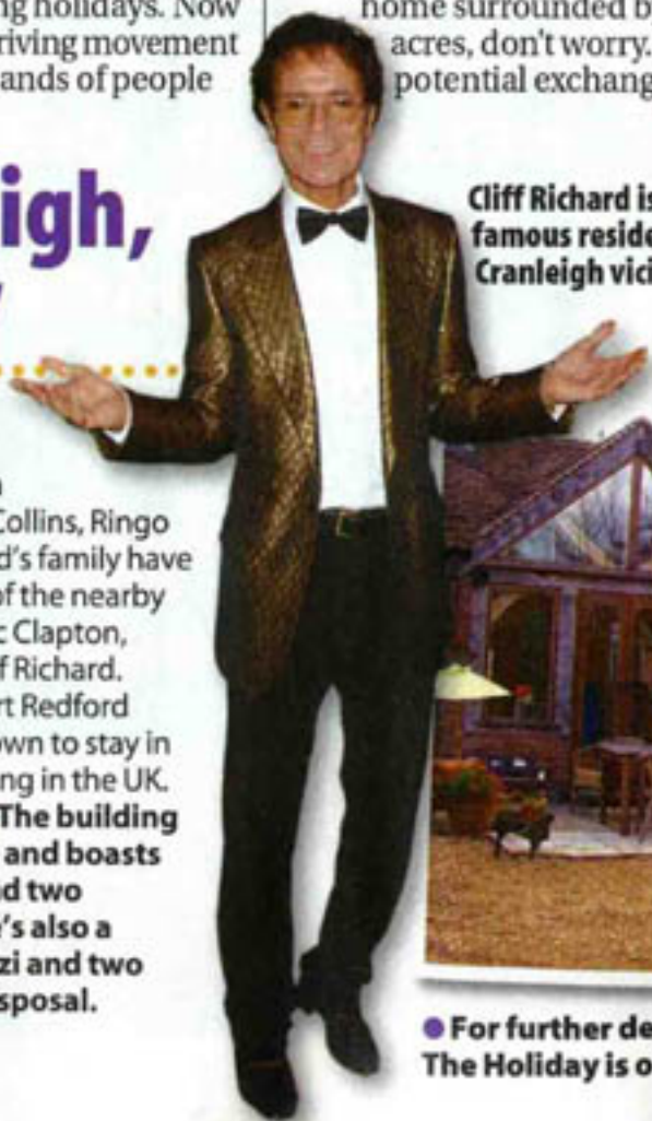
Cliff Richard is one of the famous residents in the Cranleigh vicinity

This beautiful converted country barn is situated in a village where Phil Collins, Ringo Starr and Jodie Kidd's family have homes. Residents of the nearby villages include Eric Clapton, Diana Ross and Cliff Richard. Brad Pitt and Robert Redford have also been known to stay in the area while filming in the UK. Accommodation The building is full of character and boasts four bedrooms and two bathrooms. There's also a hot tub and Jacuzzi and two cars are at your disposal.